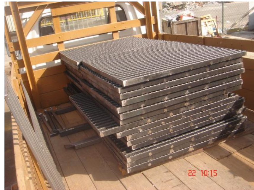
Asian Supply Base, Labuan Qty :- 30m 2